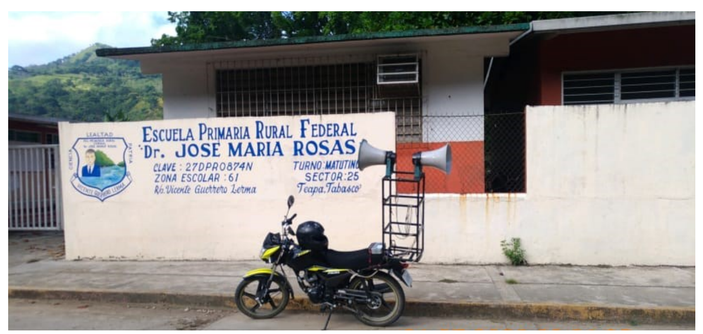
Louderspeaker that transmitted the audio through the community Vicente Guerrero "Las Nieves", Teapa Tabasco. Photo: PRAIM, 2020